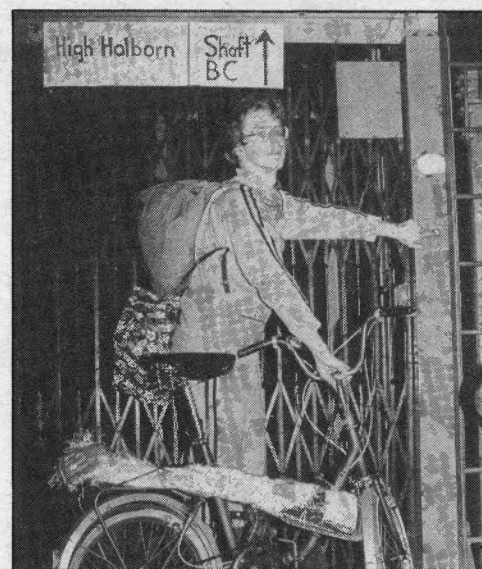
The lift in shaft BC emerges just a few steps from the door of the NS off High Holborn.

A right turn into Tunnel M offers the prospect of a jaunt a hundred feet below Drury Lane. A little sign indicates that Fleet Street's