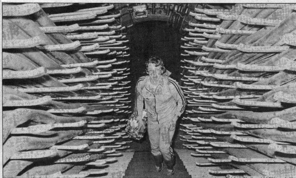
Stairs lead up from the deadly Euston tunnel to the Holborn tunnel.

Close at hand, shafts GA and BC, complete with lift, now emerge in Holborn Telephone Exchange, and the entrance to this building is a mere 30 yards from our Great Turnstile offices. This geographical good fortune has already been communicated to other staff, and plans are in hand for commandeering the place as a People's Nuclear Shelter (with especial reference to journalists) should the Worst happen, or be thought likely. Until then, our handy Holborn shafts provide convenient access to